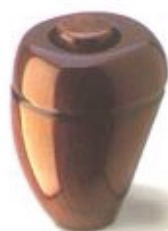
Automatic transmission gear knob

For V8 Vantage owners we can offer a conversion to five speed close ratio manual transmission, giving improved performance and driveability. In addition, changes to the gearshift linkage give improved precision and feel. For cars fitted with four speed automatic transmission an overdrive switch is incorporated into the gear knob to provide improved driver control over fourth gear selection. On the V8 Vantage model this is coupled to a change to the differential ratio.