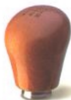
Manual transmission gear knob