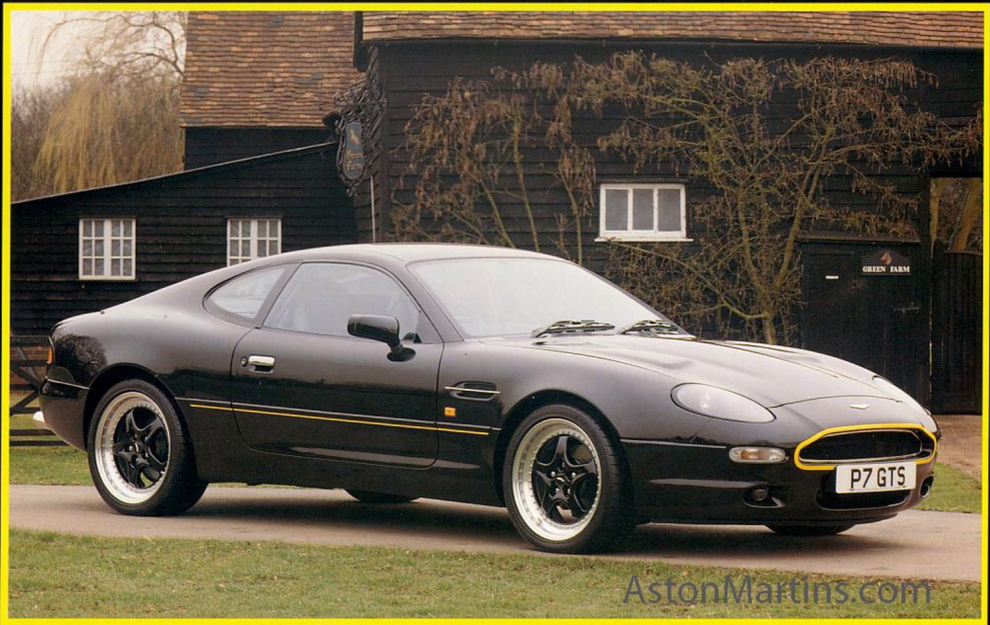
ASTON MARTIN DB7 GTS