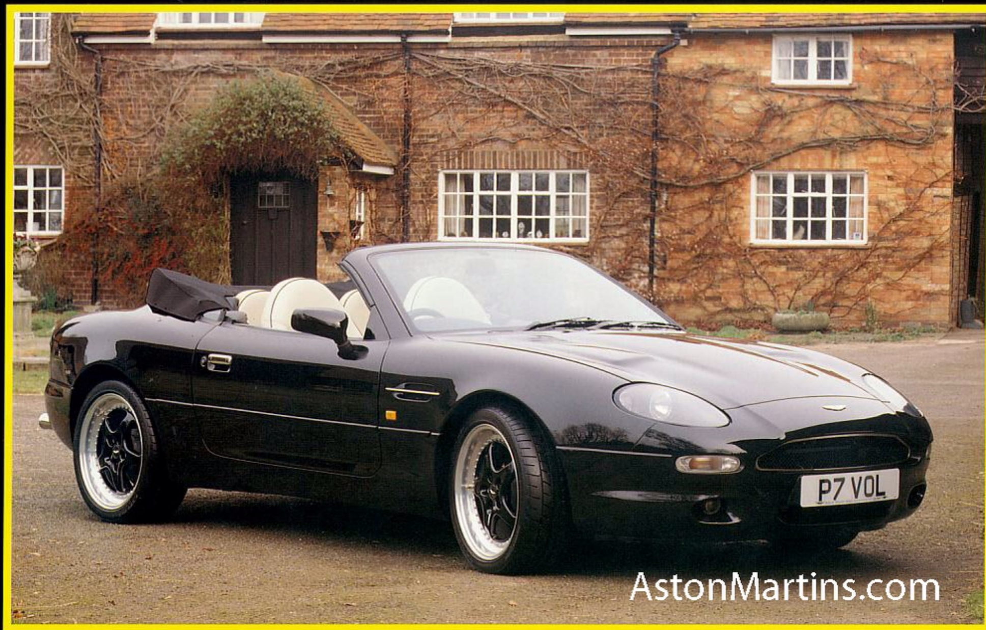
ASTON MARTIN DB7 VOLANTE GTS